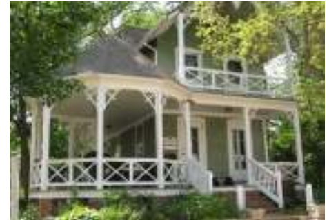
Cottage Hours: Every Wednesday 2 - 4:00 & 3rd Saturday of the month, 10am—Noon

We are fortunate to have a few of the children's models on display in the Cottage Museum. Be sure to stop by